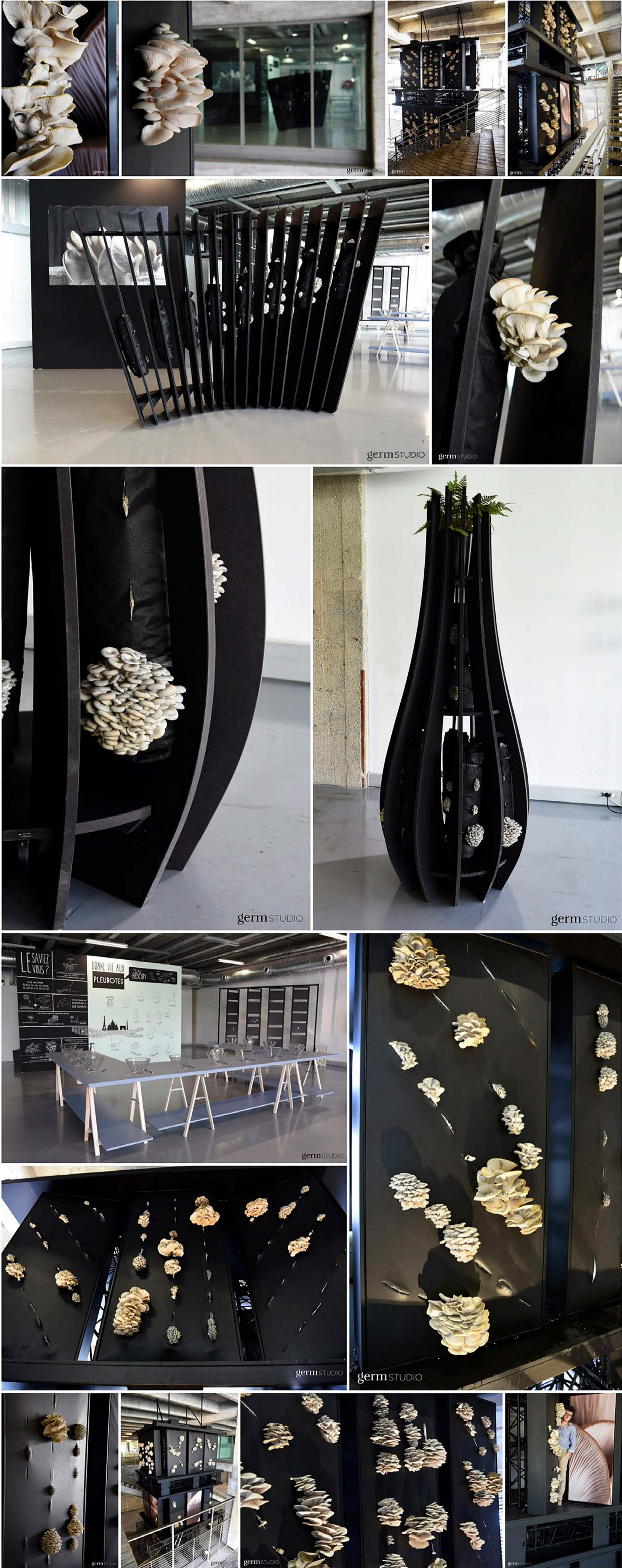
Pictures courtesy of the designer. All rights reserved to Germain Bourré.